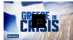
Greece's Varoufakis to Quit if Cuts OK'd