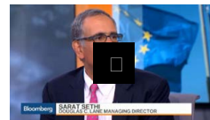
How to Trade Markets During Greece Crisis