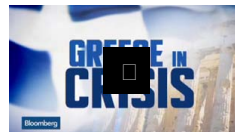
Greece's Varoufakis to Quit if Cuts OK'd