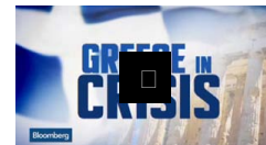
Greece's Varoufakis to Quit if Cuts OK'd