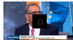
How to Trade Markets During Greece Crisis