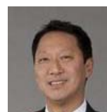
Santa Ono JD RF Southwest Ohio